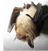
Northern long-eared

For information on cavern tour dates, become a member of the Conservancy ( mississippivalleyconservancy.org/get-involved/membership ).