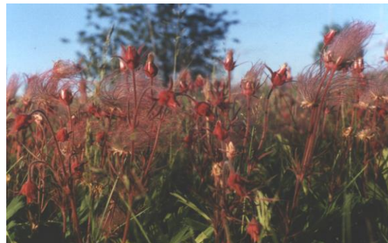
Large patches of Prairie Smoke are at HSP