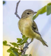
Bell's Vireo nest at HSP