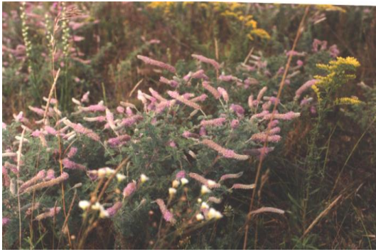
Silky Prairie Clover, one of the rare sand prairie plants that is abundant at the Holland Sand Prairie

( www.theprairieenthusiasts.org ) - TPE is a non-profit organization committed to protection and management of native prairie and savanna of the Upper Midwest. TPE assists with restoration and management.