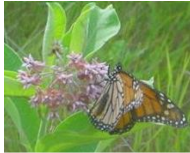
Monarch on milkweed

The most impressive attribute of the Holland Sand-Prairie is the tremendous biodiversity existing on the site. Roughly 150 species of plants have been identified to date, some of which are State threatened species or species of special concern.