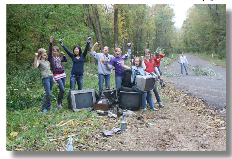
Lincoln Middle School students cheer their collection of trash during an MVC work day.