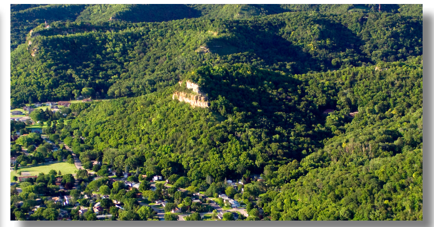
Cliffwood Bluff (center) received additional protection from a a five-acre purchase.