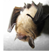
Northern long-eared

For information on cavern tour dates, become a member of the Conservancy ( mississippivalleyconservancy.org/get-involved/membership ).