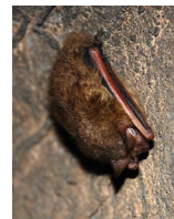
Eastern pipistrelle