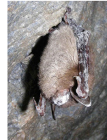
Little brown