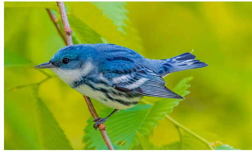
The state threatened cerulean warblers use the Plum Creek Conservation Area to raise their young.

Please respect landowners near Conservancy tracts by observing property boundaries.