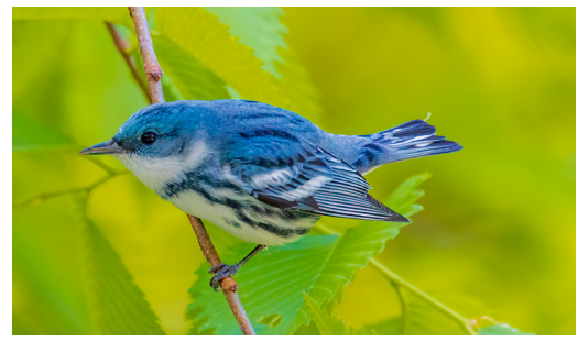
The state threatened cerulean warblers use the Plum Creek Conservation Area to raise their young.

Please respect landowners near Conservancy tracts by observing property boundaries.