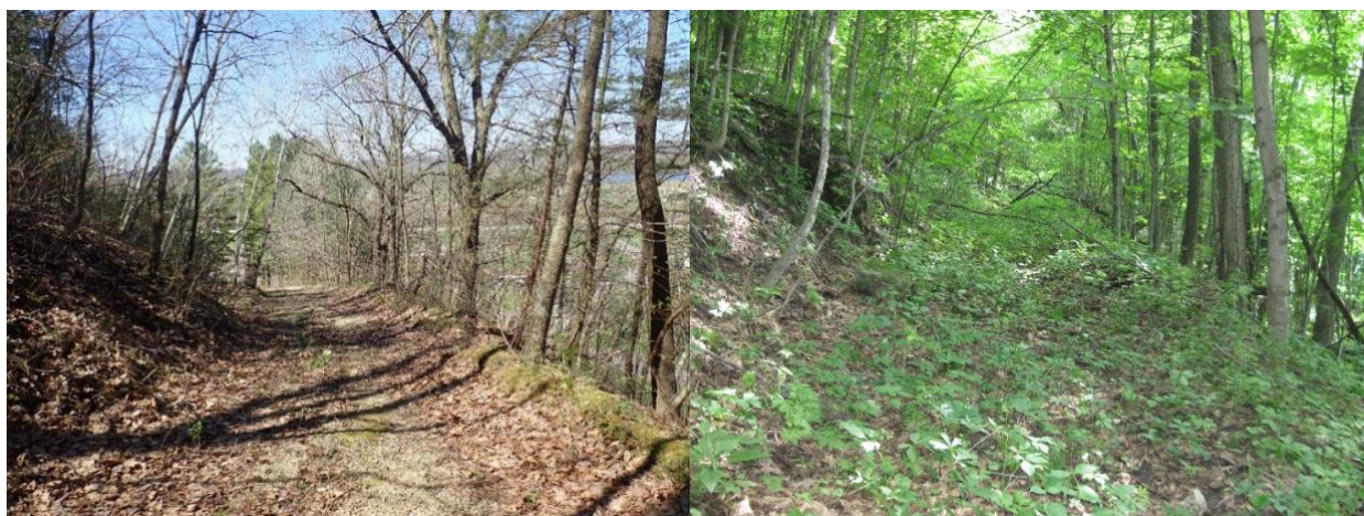
View of the trail and access across the Property