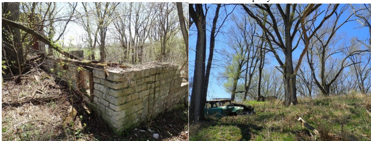
View of the historic farmstead foundation on the property