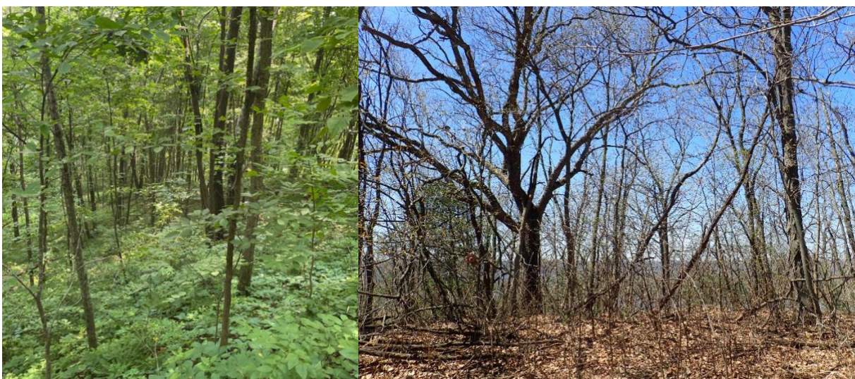
View of the forest resources on the Property